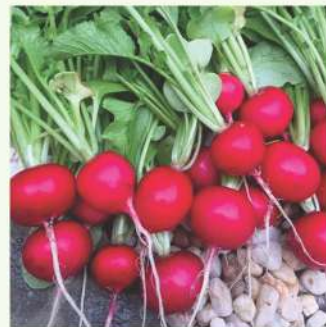
Radish Red Scarlet Globe