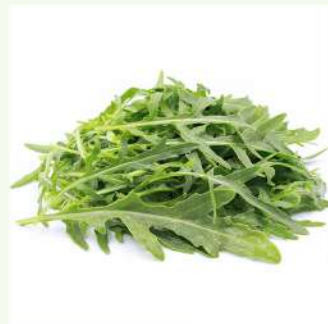
Arugula Wild Improved Rocket

2000 Seeds Rs. 90 10 gm Rs. 480 25 gm Rs. 900