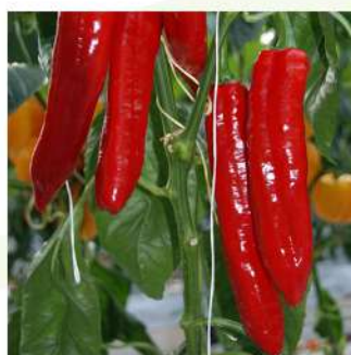
Sweet Point Red Sweet Pepper