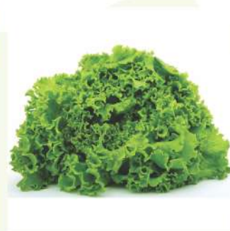
Lettuce Green Curled Leaves

250 Seeds Rs. 90 2.5 gm Rs. 380 5 gm Rs. 680