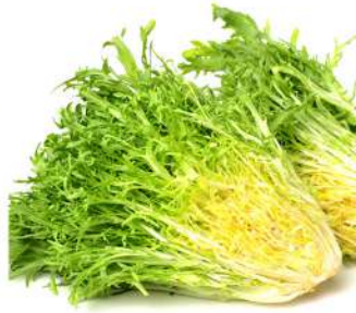
White Curled Endive