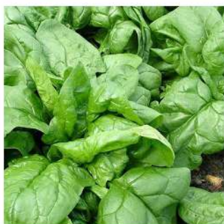
Winter Giant Spinach