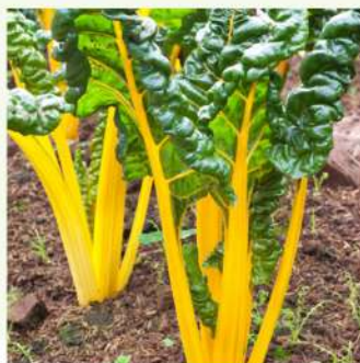
Golden Sunrise Swiss Chard