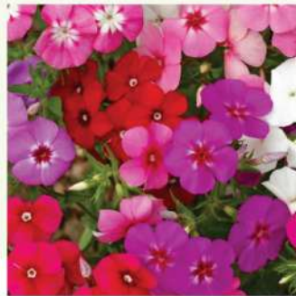
Phlox Beauty Mix