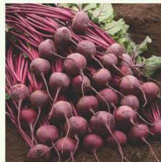
Beet Root Red