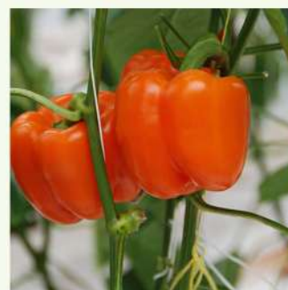
Orange Blocky Sweet Pepper