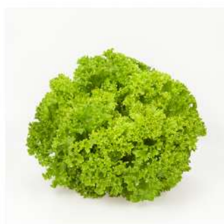
Lolo Bionda Lettuce

250 Seeds Rs. 90 2.5 gm Rs. 380 5 gm Rs. 680