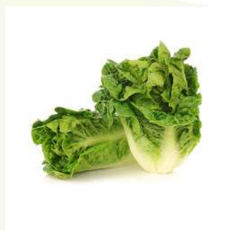
Romain Little Gem Lettuce

250 Seeds Rs. 90 2.5 gm Rs. 380 5 gm Rs. 680