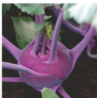
Kohlraby Vienna Purple