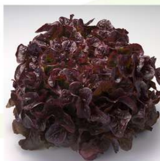
Red Salad Bowl Oakleaf Red Lettuce

250 Seeds Rs. 90 2.5 gm Rs. 380 5 gm Rs. 680