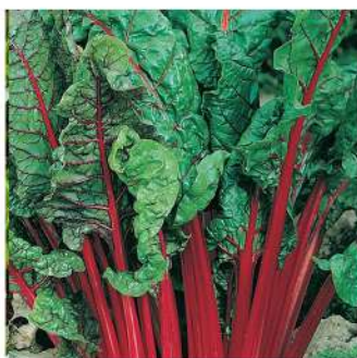
Red Rhubarb Swiss Chard