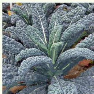
Tuscan American Kale

50 Seeds Rs. 90 5 gm Rs. 450 10 gm Rs. 850