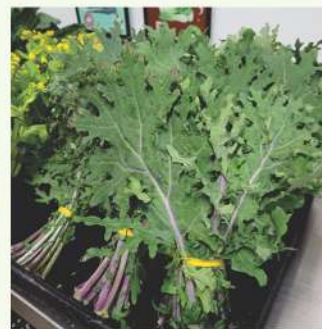
Red Russian Kale

150 Seeds Rs. 90 5 gm Rs. 450 10 gm Rs. 850