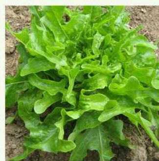
Catalogna Green Lettuce

250 Seeds Rs. 90 2.5 gm Rs. 380 5 gm Rs. 680