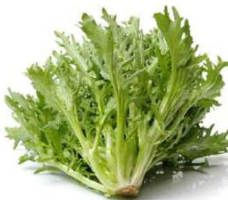
Salad King Endive