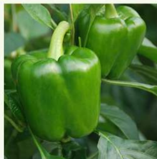
Green Sweet Pepper