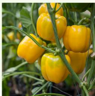
Yellow Blocky Sweet Pepper