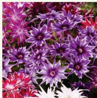
Phlox Star Mix