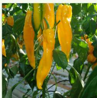
Sweet Point Yellow Sweet Pepper