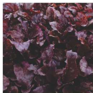
Beet Bulls Blood