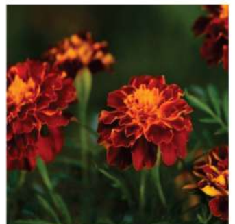
Marrygold French Red