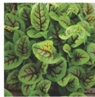
Sorrel Red Veined