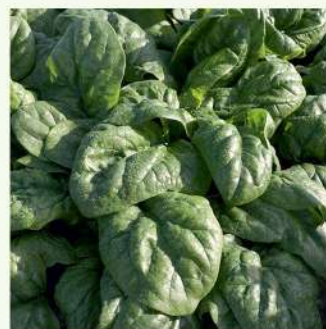
Merlo Nero Spinach