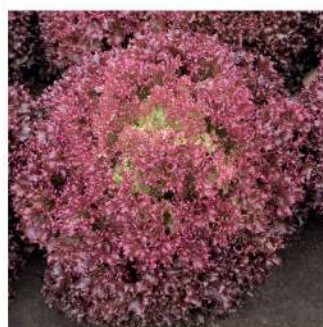
Lolo Rossa Lettuce

250 Seeds Rs. 90 2.5 gm Rs. 380 5 gm Rs. 680