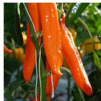
Sweet Point Orange Sweet Pepper