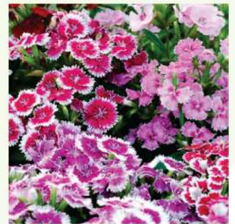
Dianthus Baby Doll