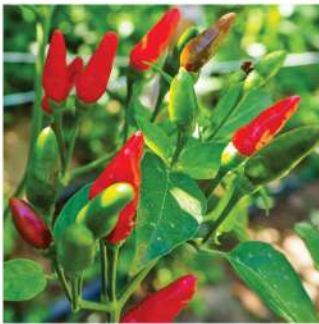
Bird Eye / Thai Chilly