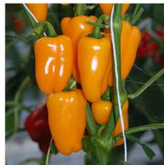
Snacky Yellow Sweet Pepper