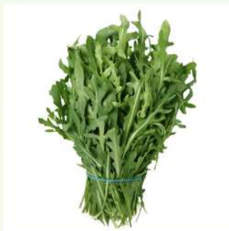
Arugula Wild Rocket

500 Seeds Rs. 90 10 gm Rs. 480 25 gm Rs. 850