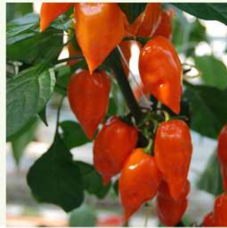
Habenaro Orange Pepper