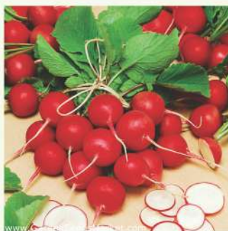
Radish Red Cherry Belle