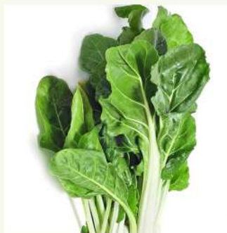
Barese white Swiss Chard