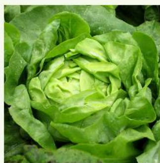
Butterhead Green Lettuce

250 Seeds Rs. 90 2.5 gm Rs. 380 5 gm Rs. 680