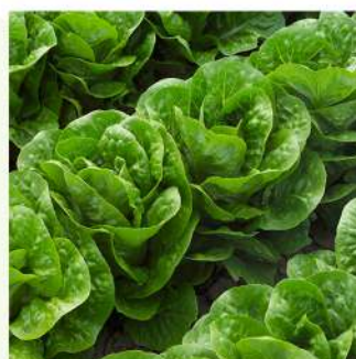
Romain Paris Island Cos Lettuce

250 Seeds Rs. 90 2.5 gm Rs. 380 5 gm Rs. 680