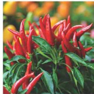
Upright Thai Chilly