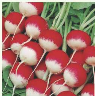
Radish Red National