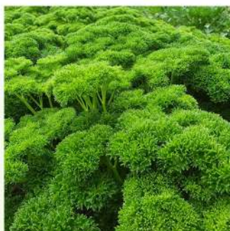
Parsely Extra Tripple Curled

500 Seeds Rs. 90 10 gm Rs. 350 50 gm Rs. 1250