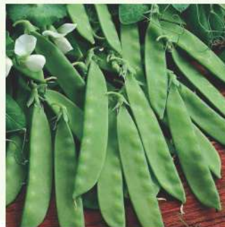
Snap Pea Sugar Pea