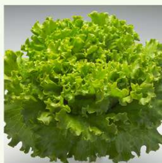
Batavia Green Lettuce

250 Seeds Rs. 90 2.5 gm Rs. 380 5 gm Rs. 580