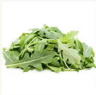
Arugula Cultivated Improved Rocket

500 Seeds Rs. 90 10 gm Rs. 450 25 gm Rs. 800