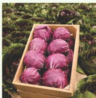
Chicory Red Ball