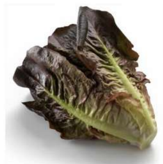
Red Romain Lettuce

250 Seeds Rs. 90 2.5 gm Rs. 380 5 gm Rs. 680