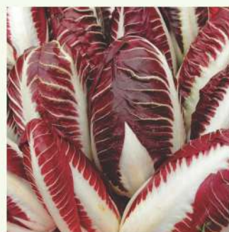
Chicory Red Verona