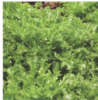
Endive Green Curled