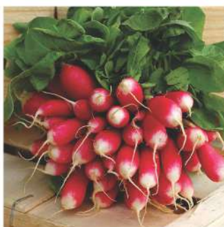
Radish Red Flamboyant