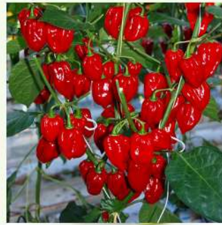
Habenaro Red Pepper