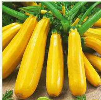
Zucchini Golden Squash