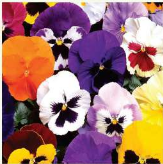
Pansy Swiss Giant Mix