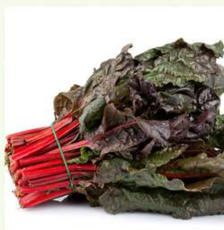
Magenta Sunset Swiss Chard