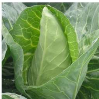
Cabbage Conical Greyhound