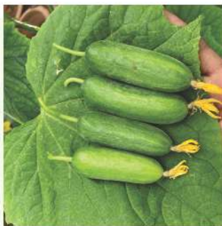
One Bite Cucumber