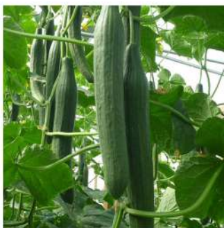
Japanese or long Cucumber