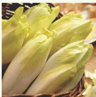
Chicory White of Milan