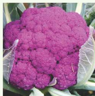
Cauliflower Purple Sicily