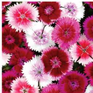
Sweet William Mix