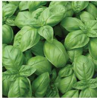
Italian Genovese Basil

350 Seeds Rs. 90 5 gm Rs. 450 10 gm Rs. 650