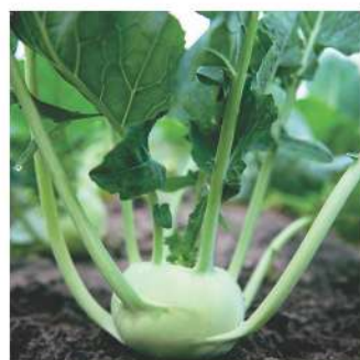
Kohlraby Vienna White