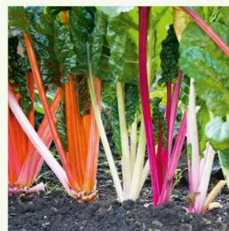
Rainbow Swiss Chard