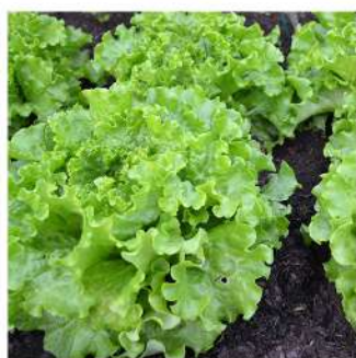
Grand Rapids Lettuce

250 Seeds Rs. 90 2.5 gm Rs. 380 5 gm Rs. 680