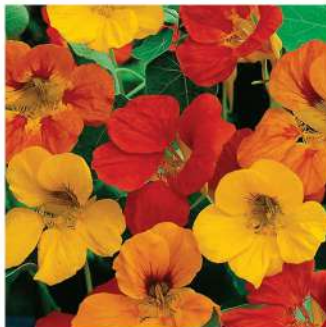
Nasturtium Alsaka Mix