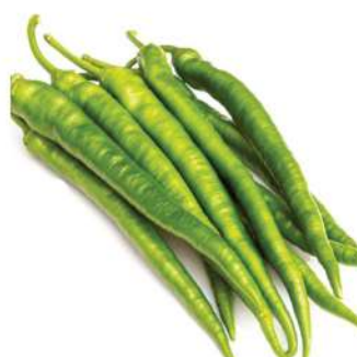
Hot Pepper Fresh Green