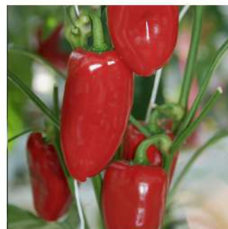
Snacky Red Sweet Pepper