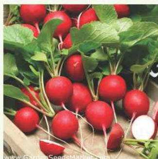
Radish Red Saxa