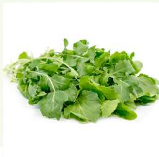
Arugula Cultivated Rocket

500 Seeds Rs. 90 10 gm Rs. 450 25 gm Rs. 800