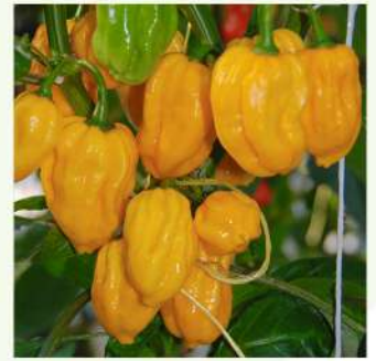
Habenaro Yellow Pepper