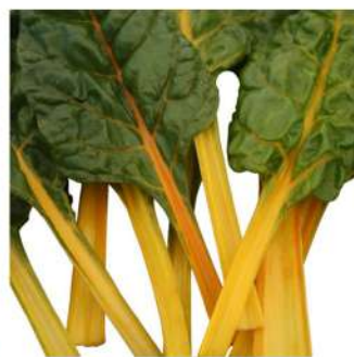
Yellow Dorat Swiss Chard