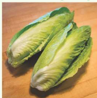
Chicory Radicho Pain De Sucre