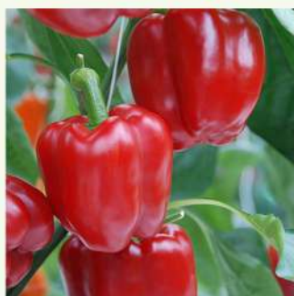
Red Blocky Sweet Pepper