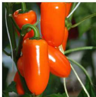
Snacky Orange Sweet Pepper